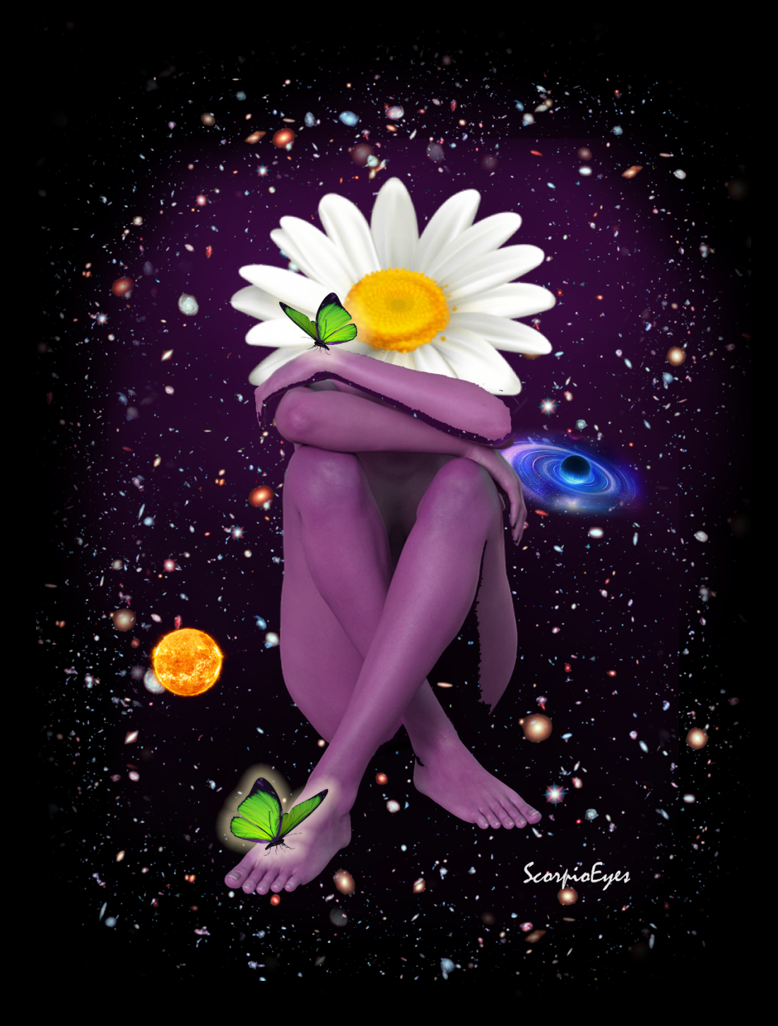
Title: WOMAN is fragile